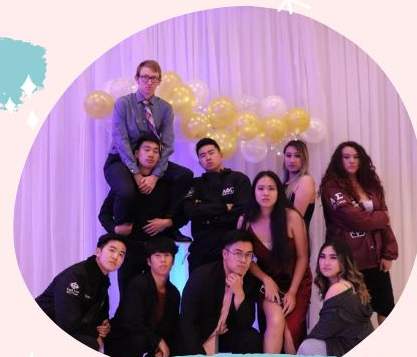
alpha phi omega - service frat end of term banquet