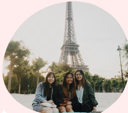
study abroad - Sussex 2019 Paris, France