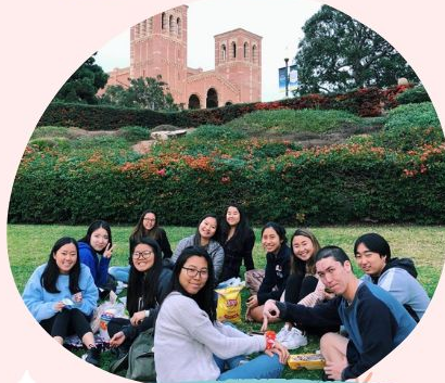
hui o 'imiloa - Hawai'i club picnic at royce hall / janss steps