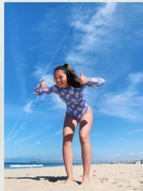
HOBBIES INCLUDE: HITTING THE BEACH WHENEVER POSSIBLE