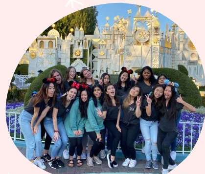
bruin belles service association disneyland retreat