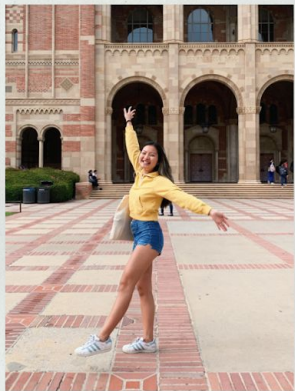
3RD YEAR PSYCHOBIOLOGY MAJOR