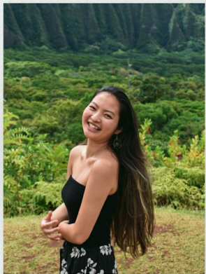
HOMETOWN: KĀNE'ŌHE KAMEHAMEHA SCHOOLS KAPĀLAMA ('18)