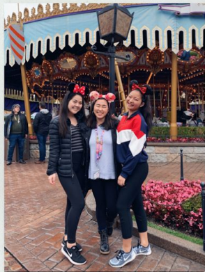
PERKS OF GOING TO SCHOOL IN LA: DISNEYLAND!!