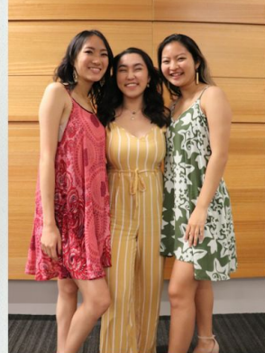
HUI O'IMILOA BANQUET